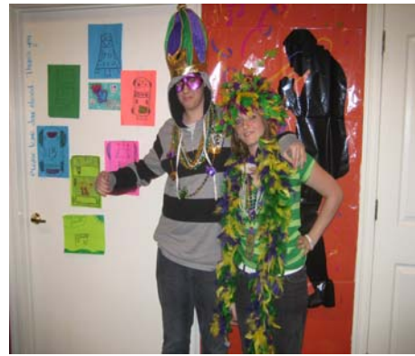
King & Queen of the Mardi Gras, 2009