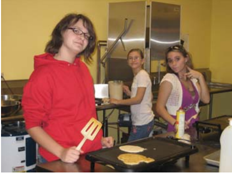
Shrove Tuesday Pancake Supper, 2008