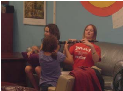
Using our God given talents, 2008