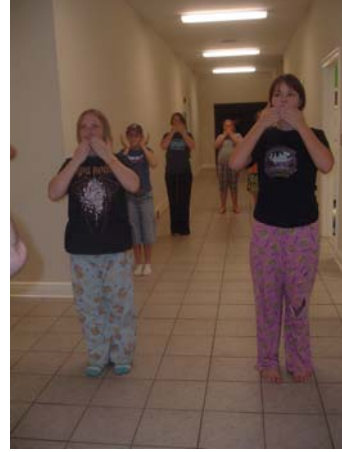
Hyper Simon Says Lock-In Fall 2008