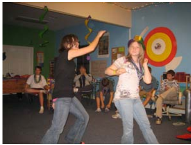
St. Jude's Got Talent, 2009